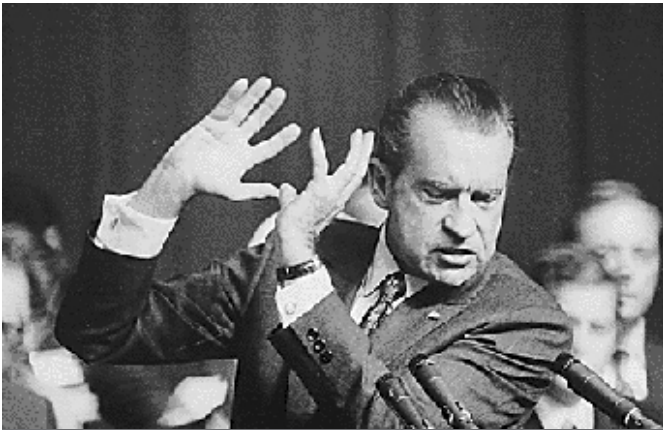
President Richard Nixon, pictured here months after he publicly proposed his “Family Assistance Plan,” in August 1969.

In August 1969, in the eighth month of his presidency, Richard Nixon delivered a speech proposing the replacement of AFDC with a program that would benefit “the working poor, as well as the nonworking; to families with dependent children headed by a father, as well as those headed by a mother.” In case the point was missed, he continued: “What I am proposing is that the Federal Government build a foundation under the income of every American family with dependent children that cannot care for itself — and wherever in America that family may live.”