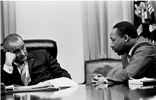
Dr. Martin Luther King, Jr. and President Lyndon Johnson meet in March 1966. King favored guaranteed income as a method for eliminating poverty.

During the 1940s, conservative economists Milton Friedman and George Stigler had laid out the principles for a "negative income tax" (NIT). Each proposed to trigger government subsidy of a household when that household's income dipped below a specified floor (the subsidy would have been designed to raise the household's income to that minimum level), but at the time, the proposals were largely ignored.